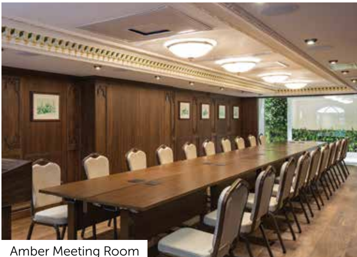
Amber Meeting Room

Each room is elegantly furnished and equipped with technology and facilities which, coupled with flawless service, help produce an environment for uniquely successful events.