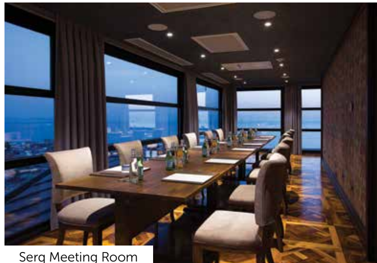
Serq Meeting Room